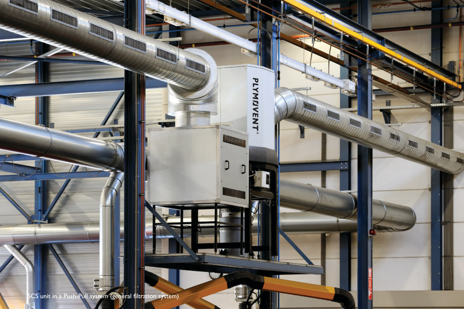
SCS unit in a Push-Pull system (general filtration system)