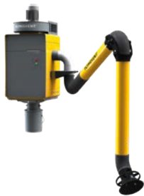
WallPro Single with Direct Mounted (DM) extraction arm