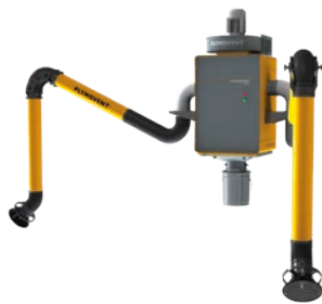
WallPro Double with Direct Mounted (DM) extraction arms