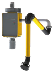
WallPro Single with External Mounted (EM) extraction arm