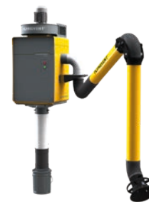
Option: Dustbin extension set

* Ask your sales representative for the complete list of configurations.